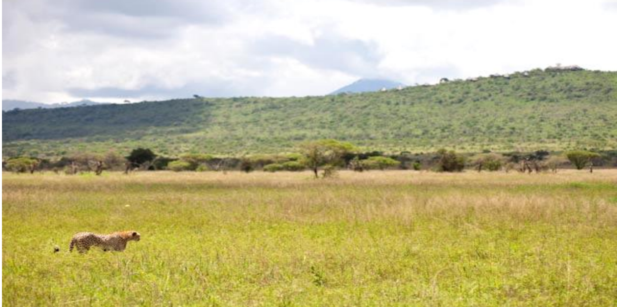
Cheetah at 'The Bluff'

Oryx tours at Nakumatt Likoni are no longer our central booking office However they are agents for Lions Bluff and act as a dropping zone For reservations contact Andrew +254 722823366/733990071