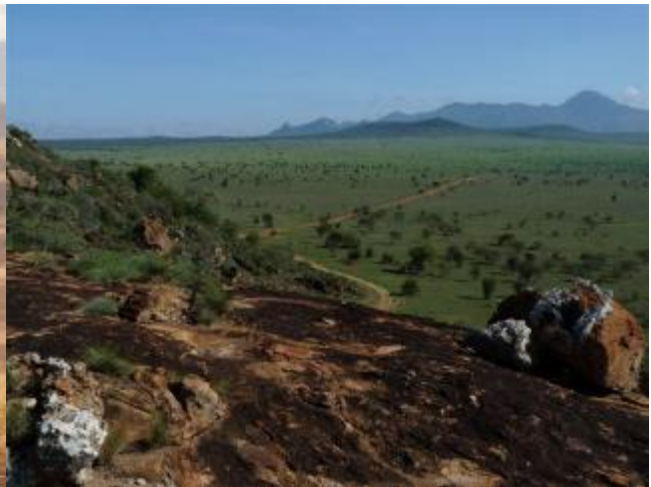
Lumo Community Wildlife Sanctuary in drought ( Lions Bluff is just visible) and verdant green

The community have been very supportive of our efforts to revive the lodge and improve its image. With the increase in Sanctuary fees from visitors to Lions Bluff the rangers' salaries are now paid on time and a road and water upgrade program is the priority. Managing water by rehabilitating dams and sinking boreholes will enable the Sanctuary to control the livestock and wildlife movement. This requires the support of donors and friends of the community wildlife project and will mean that residential herds can once more be the norm in this part of the Tsavo eco system.